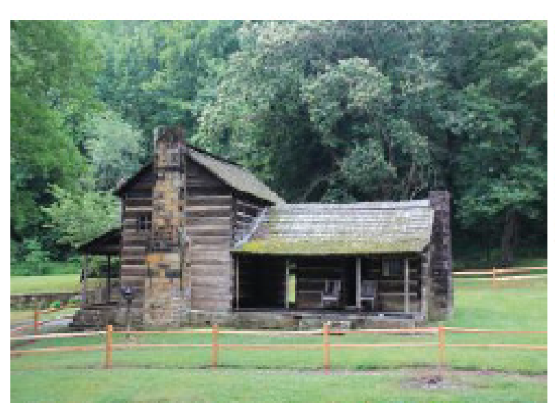
Changing lives since 1921 www.rbmission.org

"A praying people answering peoples' prayers"