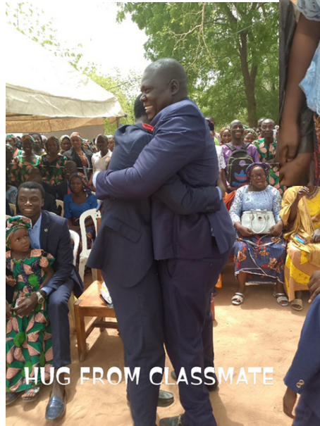
HUG FROM CLASSMATE