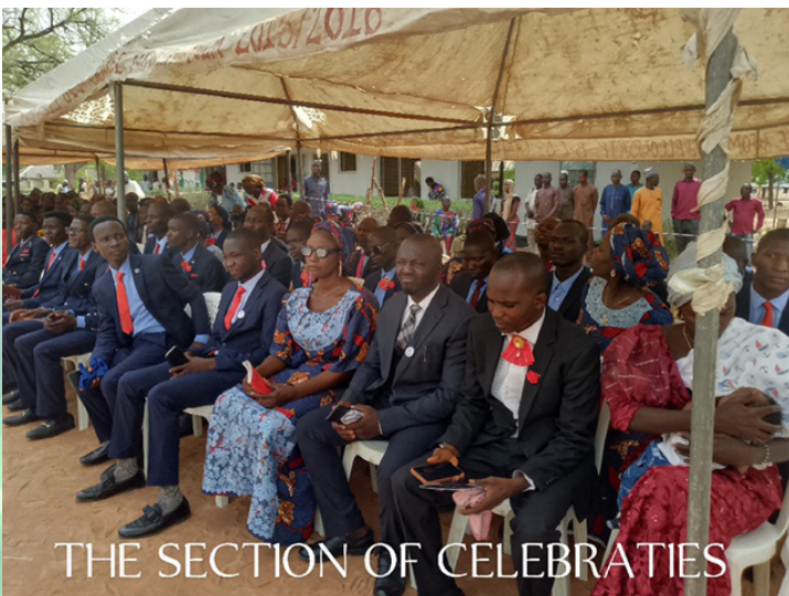
THE SECTION OF CELEBRATIES