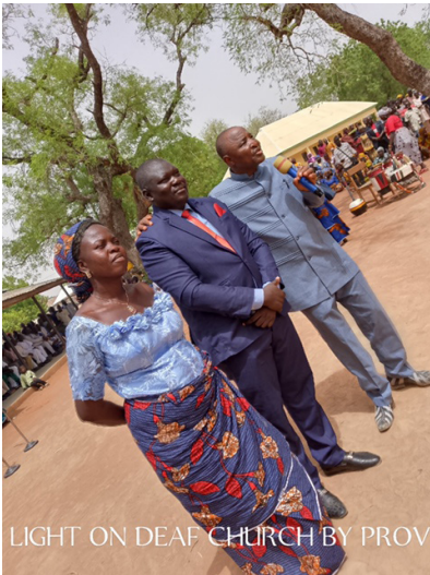
LIGHT ON DEAF CHURCH BY PROV