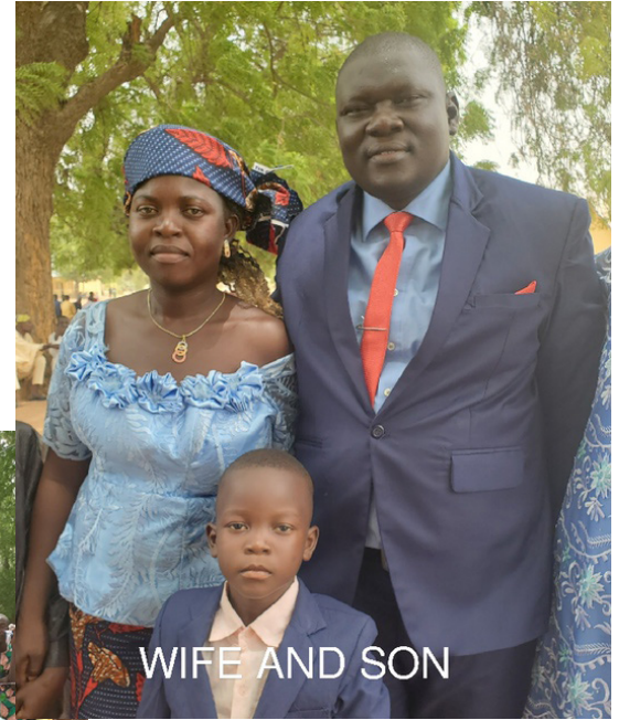
WIFE AND SON